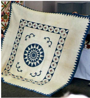
1801 Ann Moffet

Quilts with patchwork designs and dates actually on them. 22 Quilts as of October, 2008