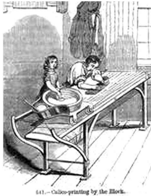
A custom table might be the largest piece of equipment a block printer owned. The apprentice seems quite young.

June 27, Oakford & La Collay (??), Darby, PA. Gillingham.