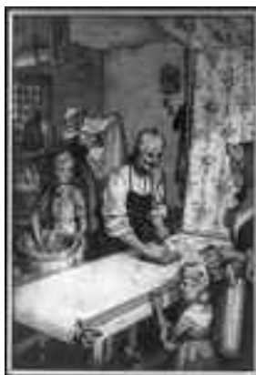
First Calico Printery Boston 1712.

"Firsts" are often dubious history. Leason & Weber advertised printing "all sorts of linens" in 1712. A Boston bank used this picture in their advertising in 1941, alluding to that ad.